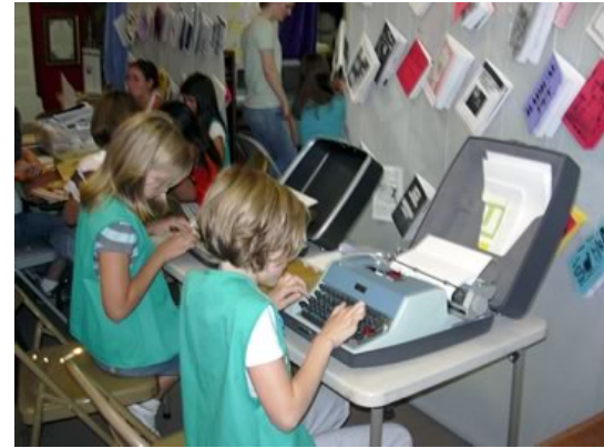
(above) Guests enter for the Women's Equality Day Fundraiser in August 2006. (above left) Members of a Girl Scout Troop from Poway type away during a Zine Workshop in October